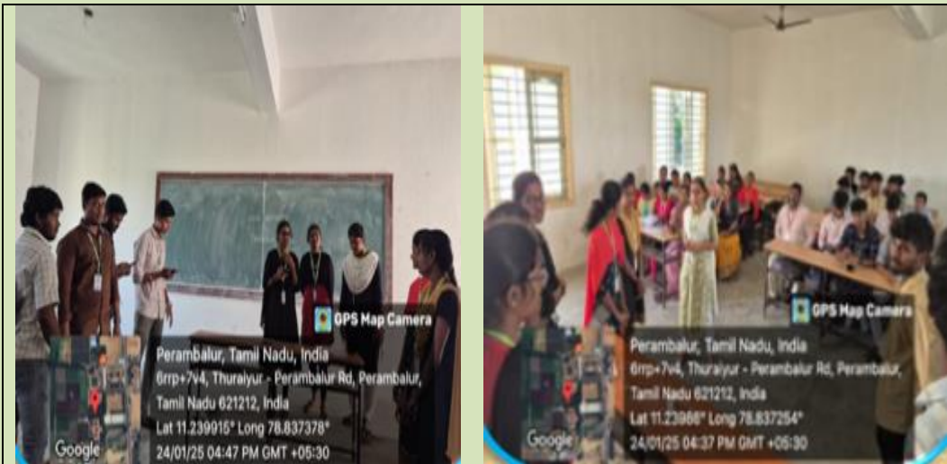
Department of Electronic and Communication Engineering organized Club Activity titled “TECHNICAL QUIZ” on 24.01.2025 for II year ECE C students..