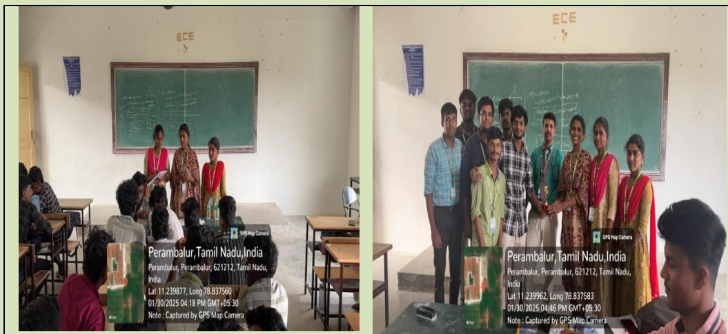
Department of Electronic and Communication Engineering have organized Professional Society Activity for second year on 30/01/2025.